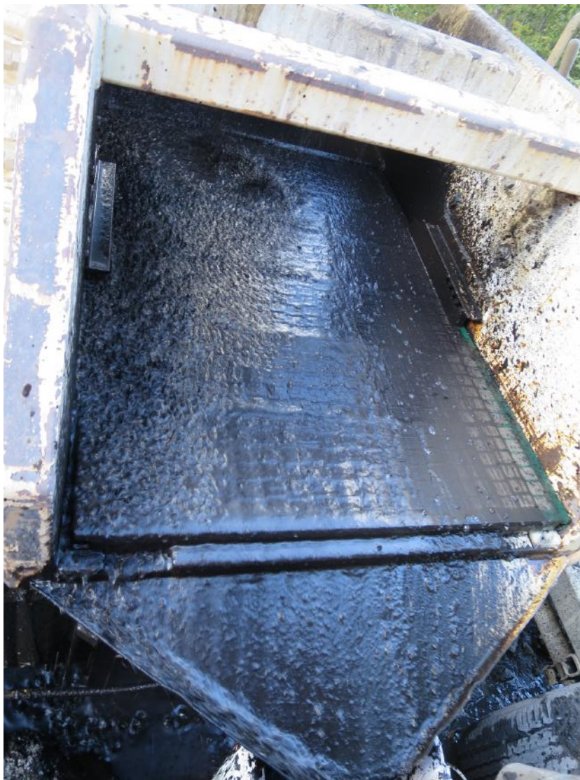
Figure 3 Coal cuttings flowing out of the drill hole during drilling (Photo 26 June 2018)