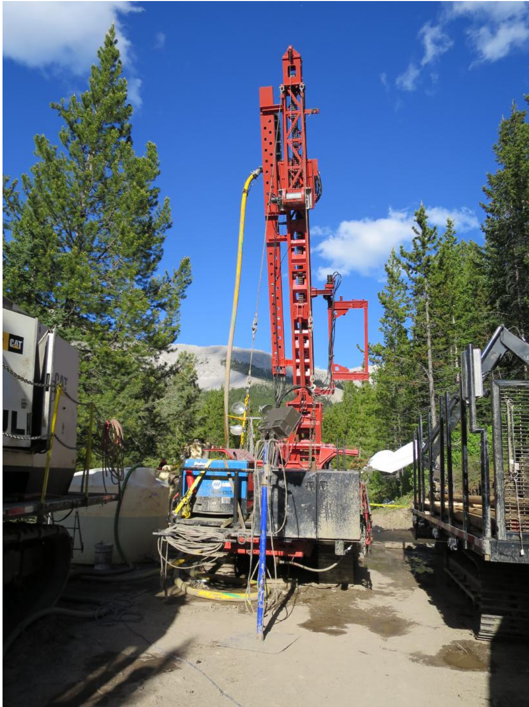
Figure 2 Drilling at Elan South (Photo 26 June 2018)